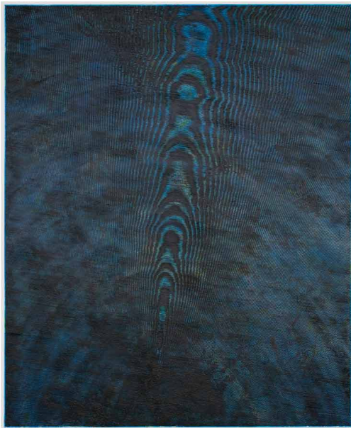
Garth Weiser, Nautilus , 2011, oil on canvas, 108 x 89.

"Garth Weiser," Art in America , September 2011, p. 132-3