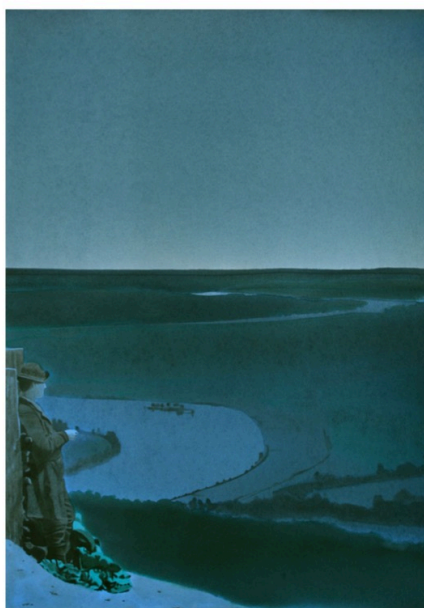
"Lookout Mountain," a 2009 Acrylic on paper by Devin Leonardi. An exhibition at the Missoula Art Museum, 'In Memoriam,' is the late artist's first showing of his work in Montana.

With drafting skills he learned at prestigious art schools, Leonardi used historical photographs as raw material to depict American history and its consequences, and in a separate body of work, he painted nudes that reference the dawn of photography and its usurping of painting's role as the means of creating images.