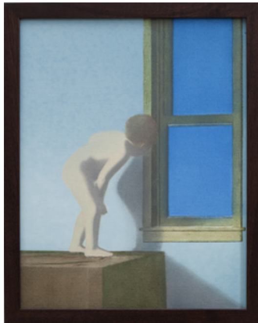
Devin Leonardi, untitled, 2010 , oil on canvas on panel, 13 3/4 x 10 3/4".