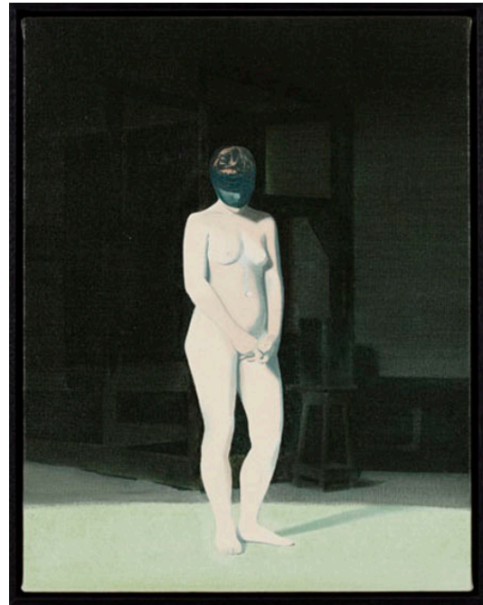
Devin Leonardi Civil History , 2011, oil on canvas

of its founding. Dexter Dalwood’s painting Mapplethorpe’s First Loft – Collage (1999), which imagines peering into Robert Mapplethorpe’s loft – with a black floor and ceiling, through the chicken wire that the photographer used to make his bedroom cage-like – evokes a similarly menacing glamour, as does the starker Mapplethorpe’s First Loft (1999).