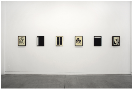
"Ordinary Objects", Laeh Glenn installation view.

Laeh Glenn's first solo exhibition at Altman Siegel is a study in genre. Addressing many defining tropes of several art movements and theoretical concerns, the work acts as a survey of various recognizable gestures, subjects and configurations as a means to question the known and what is yet to be found. Void of shine and luster, the works are painted with an extremely smooth finish, resembling images in nostalgic grey-scale newspapers or art exhibition catalogs.