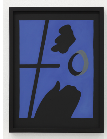
Laeh Glenn, Untitled, 2013 (LG-P13-28), 16 3/4" x 12 3/4". Oil on panel with wood.

Laeh Glenn's first solo exhibition at Altman Siegel is a study in genre. Addressing many defining tropes of several art movements and theoretical concerns, the work acts as a survey of various recognizable gestures, subjects and configurations as a means to question the known and what is yet to be found. Void of shine and luster, the works are painted with an extremely smooth finish, resembling images in nostalgic grey-scale newspapers or art exhibition catalogs.