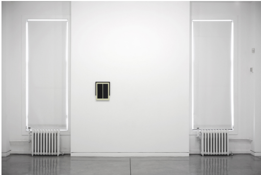
“Ordinary Objects”, Laeh Glenn installation view

reiterate what may not be “holding up” to the images’ historically heavy past it emulates.