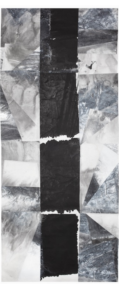
Zheng Chongbin, "Folding landscape" 348 x 140 cm, 2013 .(Image courtesy the artist and Ink Studio, Beijing).

1. Britta Erickson in Zheng Chongbin: Form, Matter, Impulse, Ink Studio: Beijing, 2014.