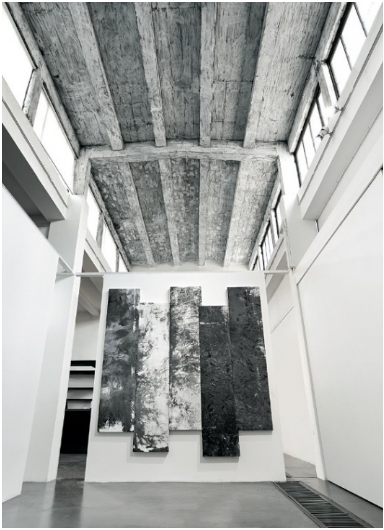
Zheng Chongbin, "5 definitions", ink and acrylic on xuan paper, 287 x 292 cm, 2012. (Image courtesy the artist and Ink Studio, Beijing).

1150 25TH ST. SAN FRANCISCO, CA 94107 tel: 415.576.9300 / fax: 415.373.4471 www.altmansiegel.com