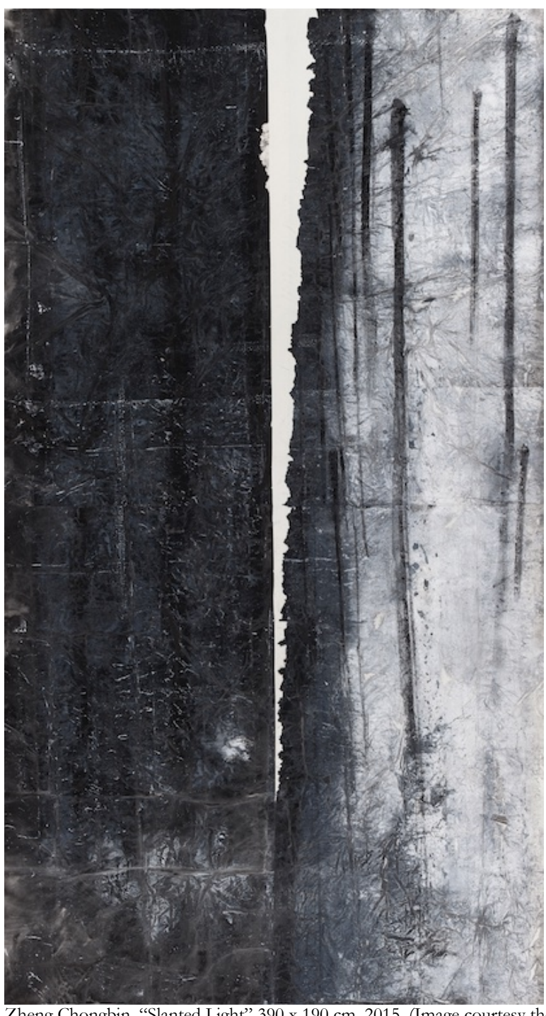
Zheng Chongbin, "Slanted Light" 390 x 190 cm, 2015. (Image courtesy the artist and Ink Studio, Beijing).

1150 25TH ST. SAN FRANCISCO, CA 94107 tel: 415.576.9300 / fax: 415.373.4471 www.altmansiegel.com