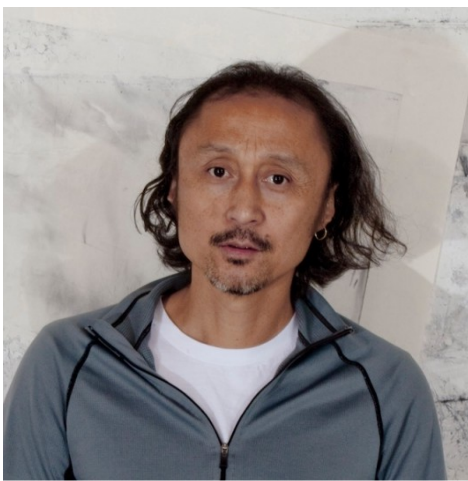
Zheng Chongbin. (Image courtesy Ink Studio).

Zheng Chongbin : Recently I gave a talk at Asian Contemporary Week in New York people view me as an ink artist, but I wanted to talk about how artists deal with media and see things broadly from the perspectives of the past, and now relative to ink art. I try to blur that boundary in my art as well—it's important not to enter more pigeonholes.