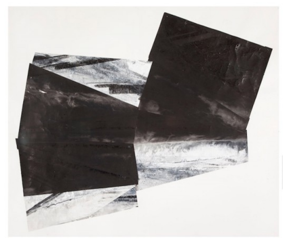
Zheng Chongbin, "Overlapped shape", ink and acrylic on xuan paper, 199 x 230 cm, 2015. (Image courtesy the artist and Ink Studio, Beijing).

ZC: She mentioned artists living today, of whom many are in a sense trans-continental. I think it's that art historians tried to differentiate abstraction [from previous movements]. But to me, really, it's just language. Every period of history refers to the previous one or to its present surroundings. I also believe artists sense the future, how art has to evolve. I think that attitude you mention is more in art criticism.