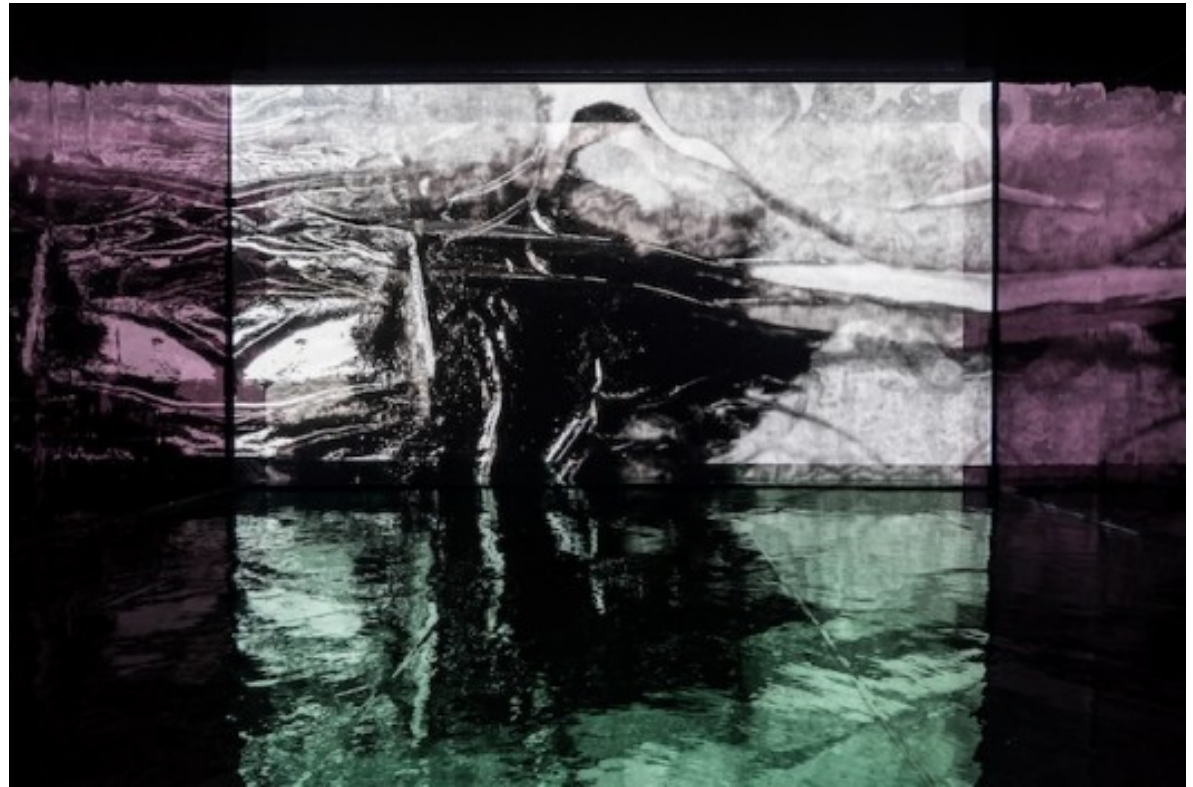
Zheng Chongbin, "Chimeric Landscape", video, 2015. (Image courtesy the artist and Ink Studio, Beijing).

be seen. So it's not what you see, it's what you want to see. I think it perfectly fits that ink has that kind of philosophical nuance in itself.