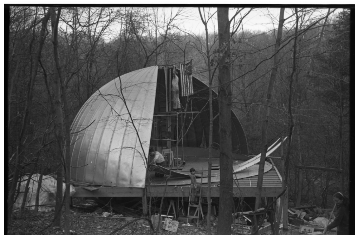
Stan VanDerBeek's Movie-Drome (1963–65) under construction in Stony Point, New York

1150 25TH ST. SAN FRANCISCO, CA 94107 tel: 415.576.9300 / fax: 415.373.4471 www.altmansiegel.com