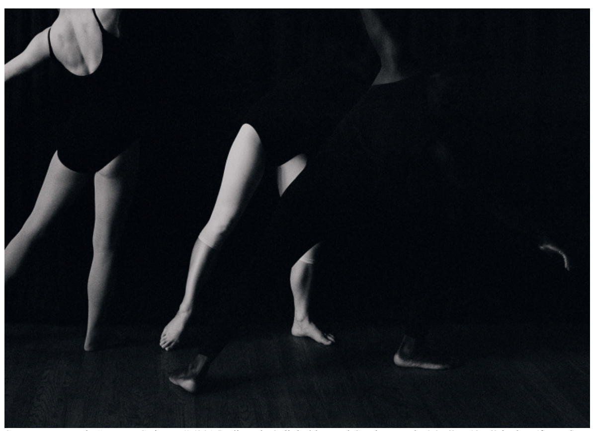
Sara VanDerBeek, "Roman Stripe IV" (2016), diptych; 2 digital layered C-prints, each: 96 7/8 x 48 7/8 inches (framed), overall: 96 7/8 x 100 3/4 inches. Edition 1 of 3, 2 APs

1150 25TH ST. SAN FRANCISCO, CA 94107 tel: 415.576.9300 / fax: 415.373.4471 www.altmansiegel.com