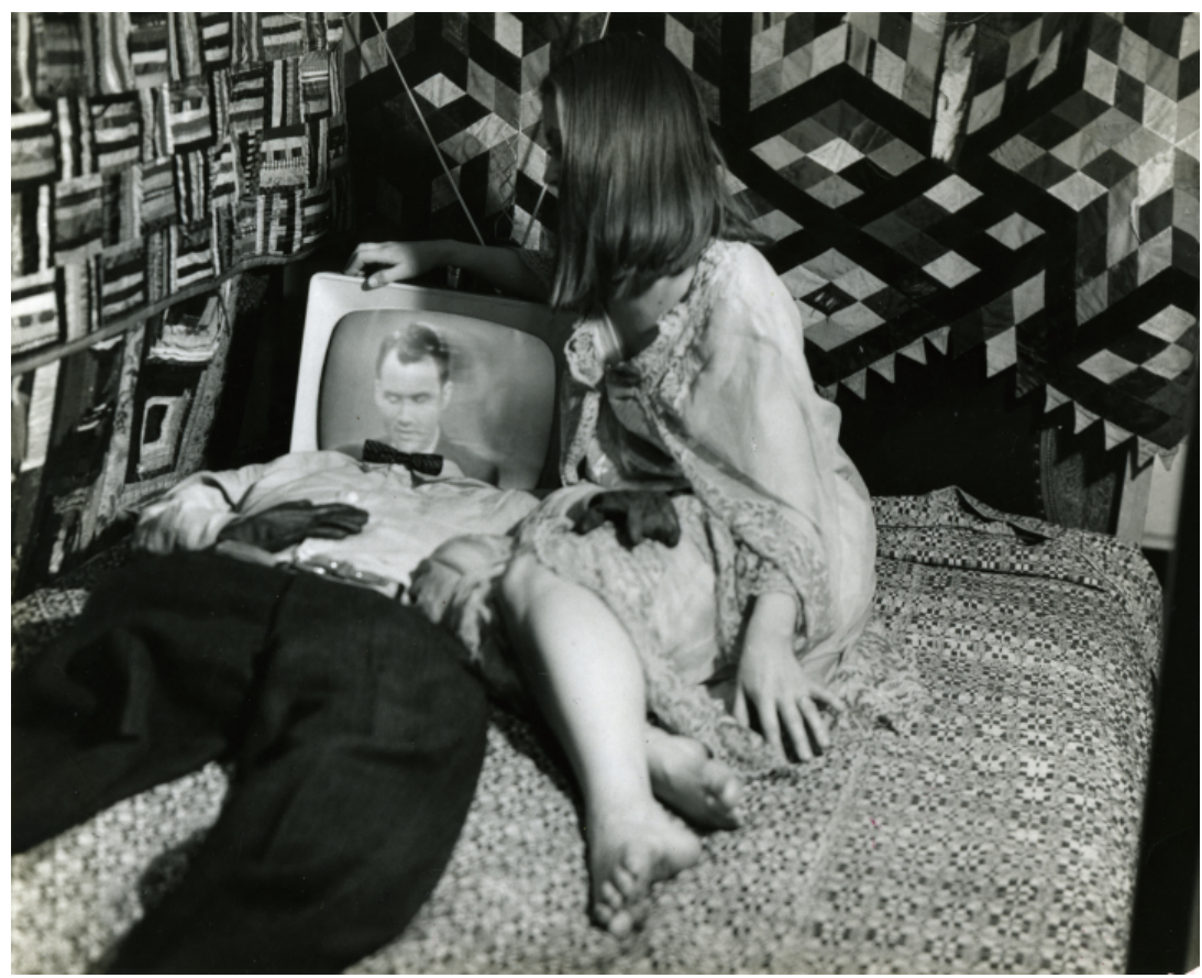
Stan VanDerBeek, still from Breathdeath (1963), 35mm film transferred to video, black and white, sound, 14.33 min.

1150 25TH ST. SAN FRANCISCO, CA 94107 tel: 415.576.9300 / fax: 415.373.4471 www.altmansiegel.com