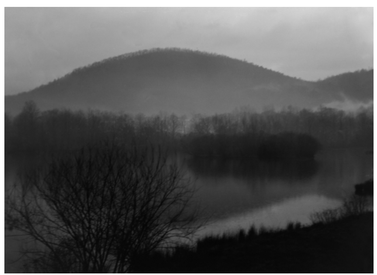
Stan VanDerBeek, "Untitled" (1950, printed 2008), silver gelatin print, 8 x 10 inches

1150 25TH ST. SAN FRANCISCO, CA 94107 tel: 415.576.9300 / fax: 415.373.4471 www.altmansiegel.com