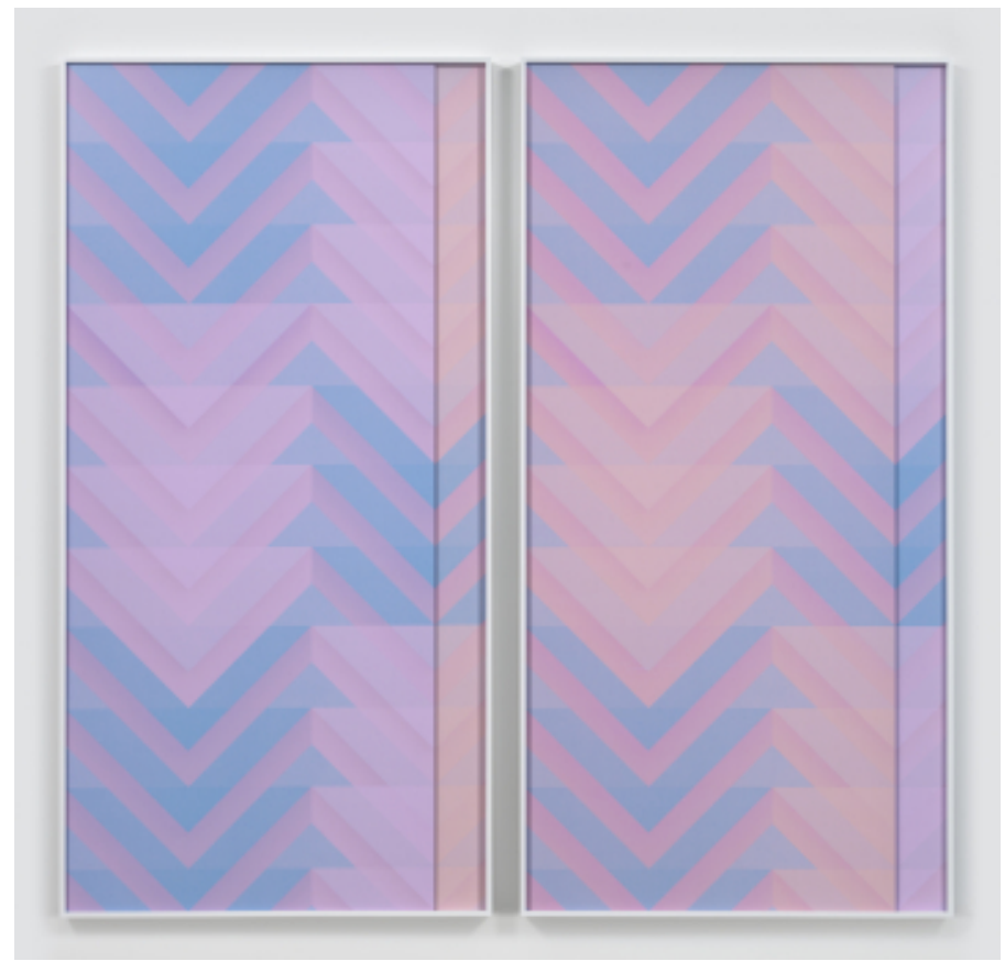
Sara VanDerBeek, "Roman Stripe IV" (2016), diptych; 2 digital layered C-prints, each: 96 7/8 x 48 7/8 inches (framed), overall: 96 7/8 x 100 3/4 inches. Edition 1 of 3, 2 APs

1150 25TH ST. SAN FRANCISCO, CA 94107 tel: 415.576.9300 / fax: 415.373.4471 www.altmansiegel.com