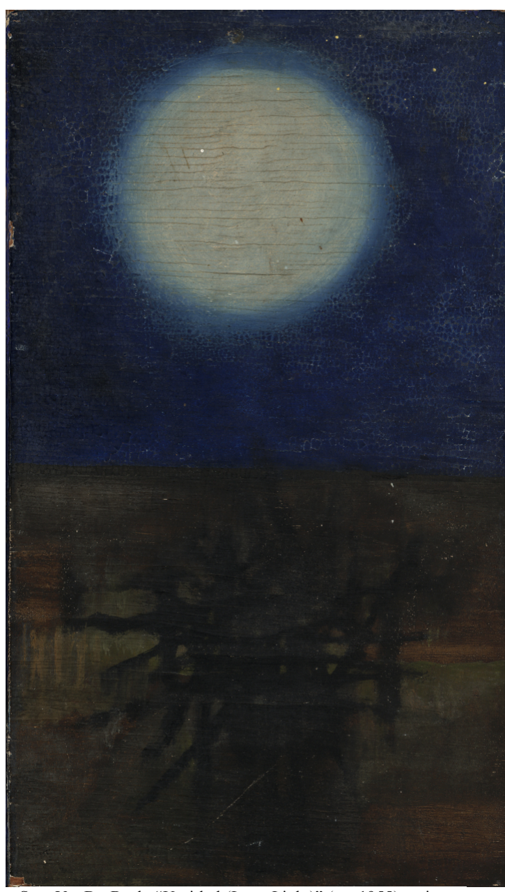
Stan VanDerBeek, "Untitled (Lune Light)" (ca. 1955), paint on wood panel, 10 3/8 x 5 7/8 inches (image); 12 3/8 x 7 7/8 inches (frame)

1150 25TH ST. SAN FRANCISCO, CA 94107 tel: 415.576.9300 / fax: 415.373.4471 www.altmansiegel.com