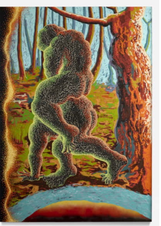
Didier William - Cheval, the Other Side of the Mirror is Home, 2023