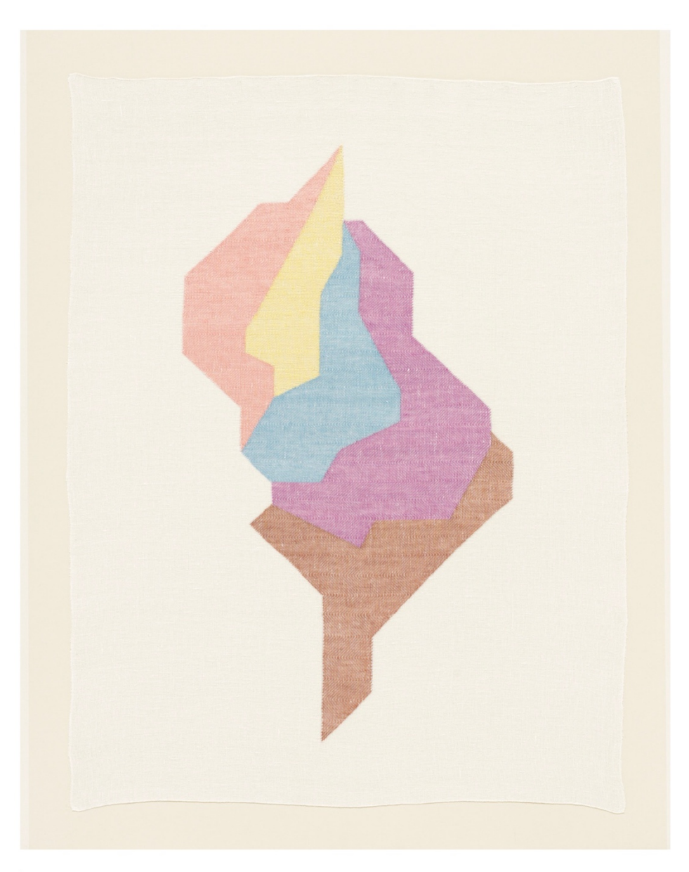
Ruth Laskey's "Twill Series (Aggregate 3)," 2021.

1150 25TH ST. SAN FRANCISCO, CA 94107 tel: 415.576.9300 / fax: 415.373.4471 www.altmansiegel.com