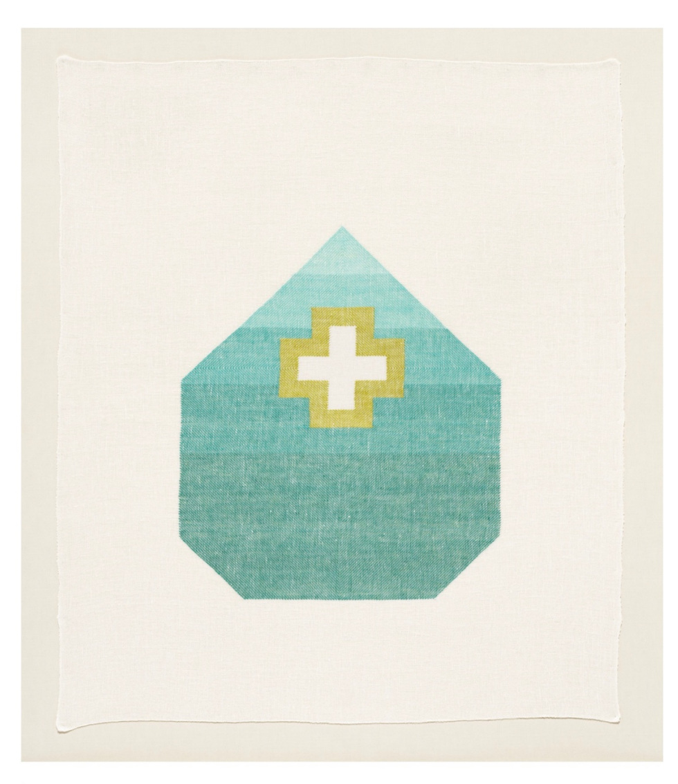
Ruth Laskey's "Twill Series (Verdigris/Chartreuse)," 2020.

1150 25TH ST. SAN FRANCISCO, CA 94107 tel: 415.576.9300 / fax: 415.373.4471 www.altmansiegel.com