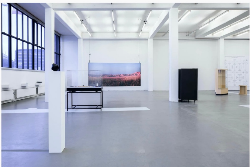
Proof of Stake Installation View, Proof of Stake – Technological Claims, Kunstverein in Hamburg, 2021