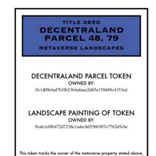
Simon Denny: Metaverse Landscape Title Deed 3: Decentraland Parcel 48, 79, 2022

Simon Denny isn't the first artist of the post-internet generation to pivot to that oldest and most saleable of analog mediums, painting. But he's one of the few to have done so with dignity and mordant wit: the New Zealander's Metaverse Landscapes (2022) don't constitute anything like a quick cash grab, even if what they depict might. Specifically, Denny's primarily oil-on-canvas paintings, which superficially resemble geometric modernist abstractions-changeably gridded divisions of the canvas square-are in fact representations of digital real estate and corresponding tokens from the Decentraland metaverse, where users buy NFTs that confer ownership of "parcels" of virtual land. The canvases reframe and expand the notion of landscape painting into god's-eye map views, quadrant by quadrant, of this growing digital topography: the object, of course, of a recent speculative gold rush of sorts. At the base of each framed canvas is an Ethereum paper wallet, linked to a dynamic NFT that tracks, in real time, dual ownerships: that of the painting itself, and that of the land token. Painting might seem an incongruous medium for reflecting on such intangible transactions; or, alternatively, a perfect one for reflecting on how temporarily hot properties change hands. Denny's series of canvases here make the case for the medium's relevance: in their own hybrid way, they move, adapt, record, andperhaps-side-eve.