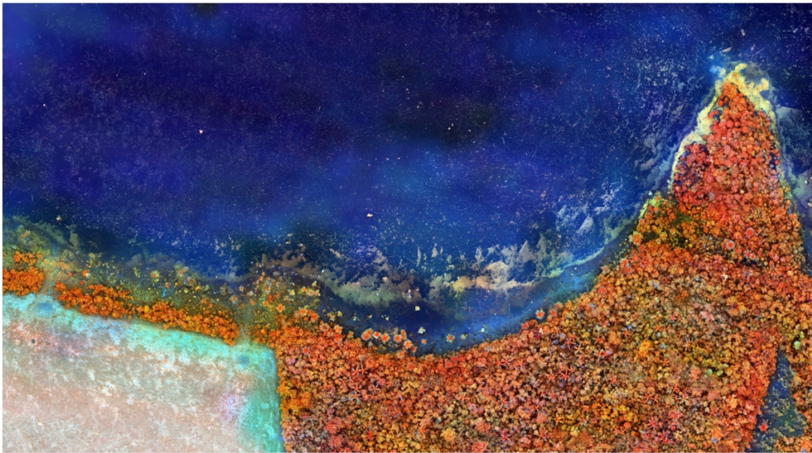
Richard Mosse, "Submerged Forest, Rondônia" (2020), archival pigment print, 59 x 106 inches (print)

One answer is that Tristes Tropiques 's flashy colors expose otherwise invisible traces of environmental damage, from subterranean fires to contaminated waters. This rationale has an important pedigree in ecological thought, dating back at least to Rachel Carson's seminal 1962 book, Silent Spring , and informing more recent ideas, such as philosopher Timothy Morton's concept of "hyperobjects" and literary critic Rob Nixon's concept of "slow violence." But Tristes Tropiques 's invisible referents remain largely unspecified and the colors that represent those referents are arbitrary, both of which decisions emphasize the work's hallucinatory surface level appearance over its underlying content.