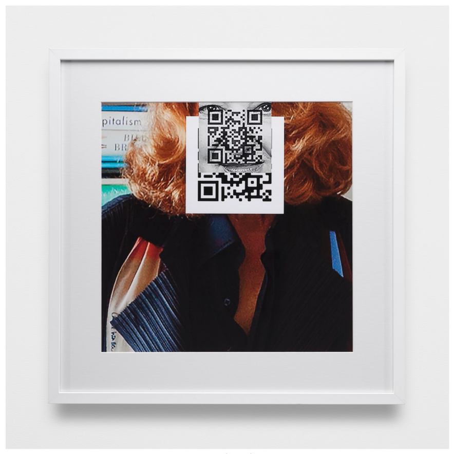
Lynn Hershman Leeson. "QR Identity Finder," 2022. Archival digital print. 25 1/4 x 25 1/4 in. Courtesy of the artist and Altman Siegel, San Francisco

1150 25TH ST. SAN FRANCISCO, CA 94107 tel: 415.576.9300 / fax: 415.373.4471 www.altmansiegel.com