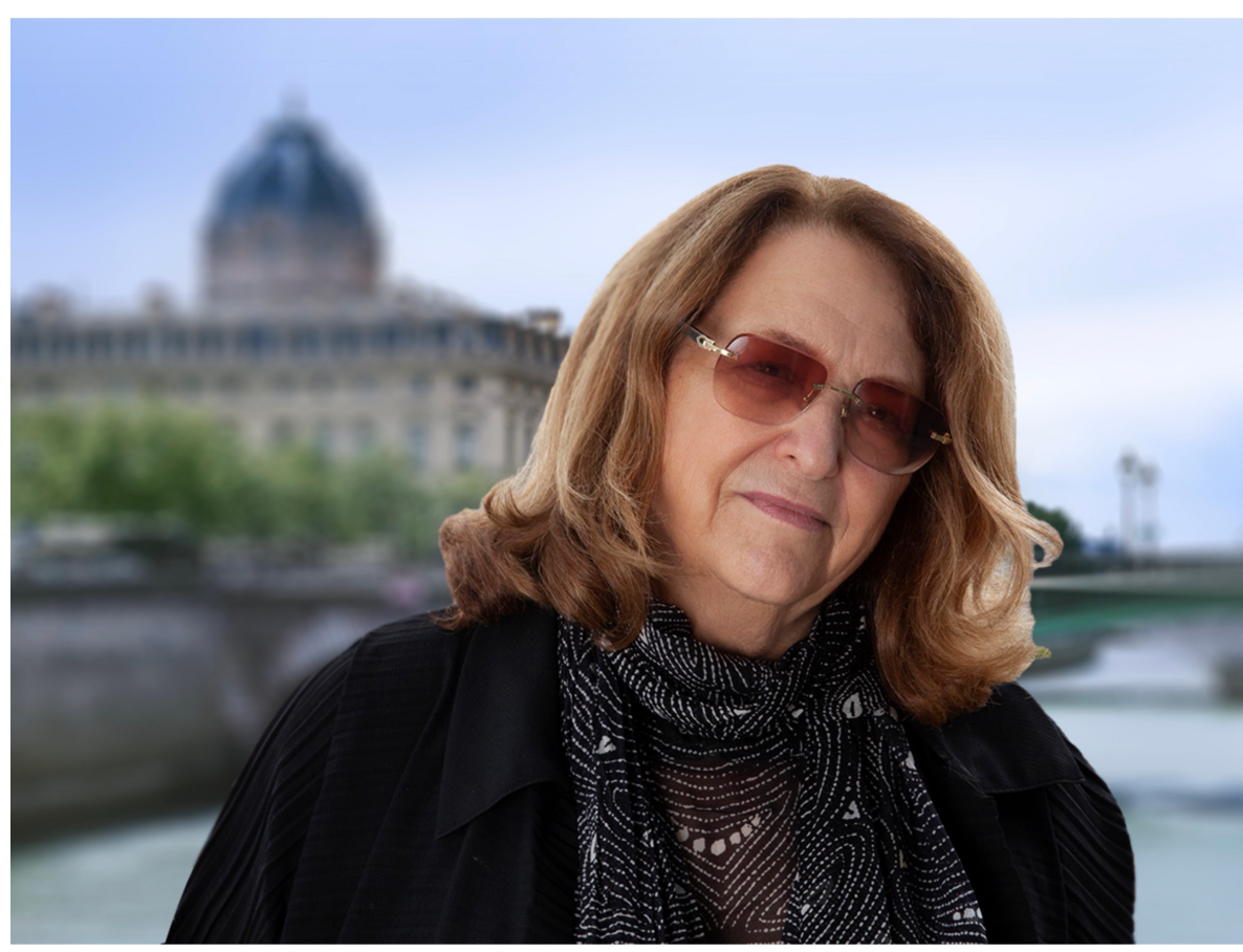
Portrait of Lynn Hershman Leeson.

1150 25TH ST. SAN FRANCISCO, CA 94107 tel: 415.576.9300 / fax: 415.373.4471 www.altmansiegel.com