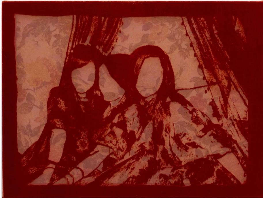
Yasmine Nasser Diaz Thick as Thieves , 2020 Ochi Projects