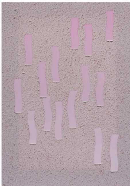
Disperse , 2013 Oil And Modeling Paste On Linen