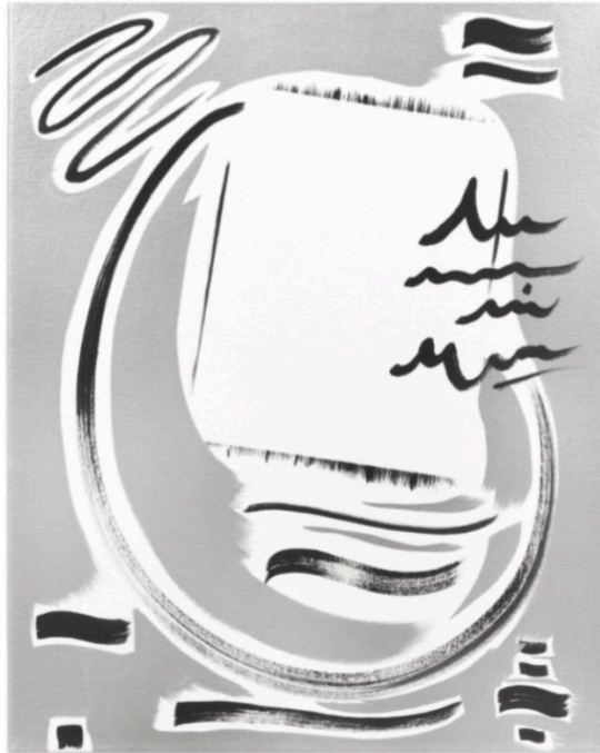
Jane Birkin Autograph , 2009 Oil On Linen 18 x 14 in

A METONYM OF SORTS for the modernist picture, the painterly mark has gotten a bad rap: too expressive, too authorial and therefore authoritarian, too sure of its inexhaustible plenitude. Every smudge of pigment at least potentially renews the old fantasy that the painter's mark can escape the fate of being a sign at all that it can embody a material immanence and immediacy alien to signification. But as an inchoate index, it also gives the lie to that fantasy, haplessly referring to itself, to the medium and its traditions, and especially to the painter. It is this last point that Los Angeles-based artist Alex Olson makes into something like a subject in her witty, prepossessing paintings, which often take their cues from written texts, including posters and fashion editorials. Olson also makes ready use of what she deems "stock signage," by which she means "flexible" forms that elude specific meaning because they've been deployed so variously. For instance, a dash or an X suggests the interpretive aspect of reading; the immediate context, i.e., the painting, constitutes the semiotic structure that will determine how we apprehend these signs that are empty, or almost empty, of any intrinsic connotations of their own. Such forms flourished in "Palmist and Editor," Olson's 2012 show at New York's Lisa Cooley gallery, for which the artist filled the space with