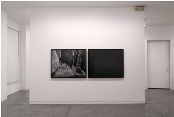
Trevor Paglen: Unhuman Installation View

this is a big hint to looking at some of my newer works), but at the same time, I'm interested in the ways that what "seeing" is, is historically specific. I'm extremely interested in what seeing is, and what seeing means in the contemporary moment. Of course, this has everything to do with machines, which in turn has everything to do with time (in several senses: 1) the ways in which machines rationalize time; 2) the ever-increasing "speed" of vision – think Predator drones in Pakistan flown by pilots in Nevada), which of course has everything to do with space (what Marx called the "annihilation of space with time" – again, think Predator drones flown from Nevada creating a relationally contiguous geography even though they're obviously on opposite sides of the world). You can see the question gets really big really quickly.