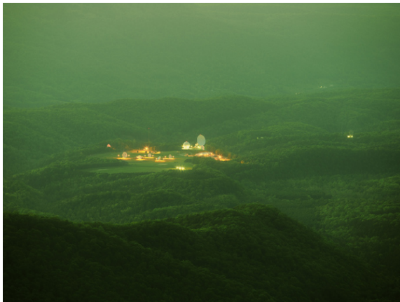
Trevor Paglen They Watch the Moon, 2010

Recent advancements in technology such as Google Earth and street-view, has given anyone with a computer and an internet connection the ability to collapse time and space. It is easy to sit in the comfort of your home and within just a few seconds, virtually place yourself anywhere in the world, that Google has imaged. This uniquely 21st century way of seeing may be relatively new to the masses, but there is no doubt that similar advancements were made years ago for military purposes. From the birth of photography, man has learned to “see with machines.” This concept is a crucial part of Trevor Paglen’s research in art and experimental geography. Paglen recently presented a new series of images, and video, in an exhibition titled Unhuman on view now at Altman Siegel Gallery in San Francisco. I recently spoke with Paglen about photography and art history, aesthetics and the politics of watching that which watches us.