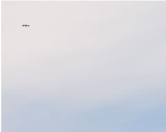
Trevor Paglen Untitled (Predators; Indian Springs, NV), 2010 - Detail

of “photography” that happens prior to the photograph itself, and we have another aspect which is the photograph or image itself. In the former sense, I’m talking about all sorts of things – on one hand, you have a technological and social history of “seeing with machines” (my definition of photography). You also have specific sets of relations that “set the stage,” as it were, before you open the shutter. In every instance, those relations are going to be different, but what I mean by “entangled” photography has to do with making those relations somehow part of the work – whether visible in the final photograph or not. And yes, the photograph in a sense does become “proof” of the action, or, more precisely, the photograph may point towards the action. But that doesn’t mean that the “relational” or “entangled” aspects of the photograph supersede the photograph itself. On the contrary, we also have the photograph itself. The image or photograph is an opportunity, related yet distinct from the “relational” aspects of the photography process, to convey other sorts of meaning, metaphor, allegory, or, if you’re so inclined (I tend not to be), documentation. So I’m not really talking about either part of the photography process superseding the other, I’m talking about the fact that there are all sorts of opportunities to develop the “relational” side of the work that can contribute to what the overall artwork is.