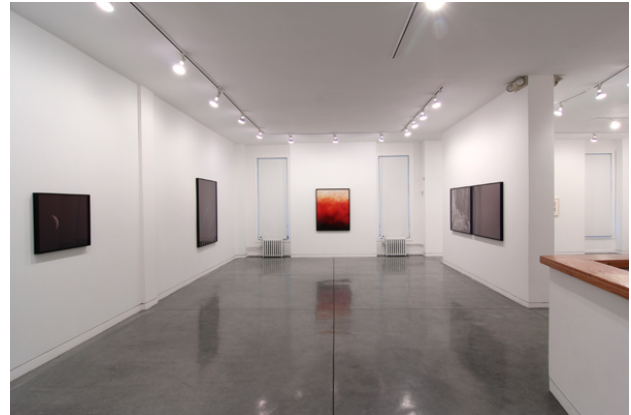
Trevor Paglen: Unhuman Installation View

relationship to landscape and the politics of visibility. While earning a MFA in Chicago, I became frustrated by the limits of traditional art theory, which mostly comes out of literary criticism, and wanted to find a more expansive theoretical language that could account for things like economics, politics, materiality, and so forth, in addition to questions of representation. Geography theory, I found, was incredibly powerful and flexible: it provided me with a way to think about cultural production in a much more powerful way than what I’d found in art and representational theory. So, I ended up moving to Berkeley and doing a PhD in geography.