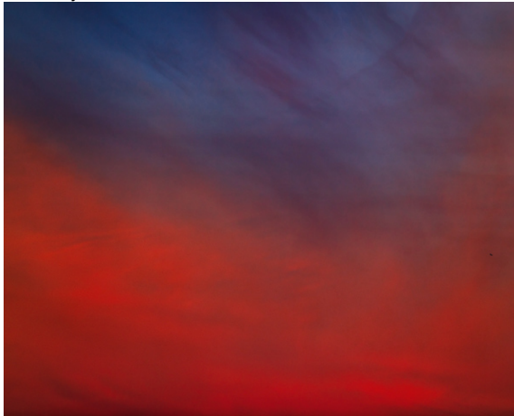
Trevor Paglen Untitled (Reaper Drone), 2010

of historical references act as guide-points that we can use to understand how to see the world now, which is ultimately what I'm interested in.