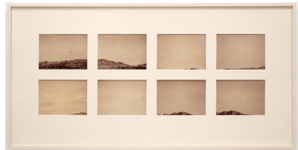
Trevor Paglen Time study (Predator; Indian Springs, NV), 2010 / Courtesy of Altman Siegel Gallery

I think I’m going to revise what I said about these relationships of seeing not being interesting to me. They are. But I think they’re part of what we might call the spatio-ethical dimension of the images’ conditions of production, rather than the aesthetic part of them. Sometimes the “entangledness” of the photograph can arise from these complex relations of seeing and counter-seeing in my work (i.e. photographing spy satellites or Predator drones photographing me), but not always. Sometimes the relational dimension can arise from the very fact of taking a photograph of something that, for political purposes, “isn’t there.” Or any number of things. But, yes, the “relational” aspects of my work are absolutely crucial, even though they’re often not self-evident in the prints themselves.