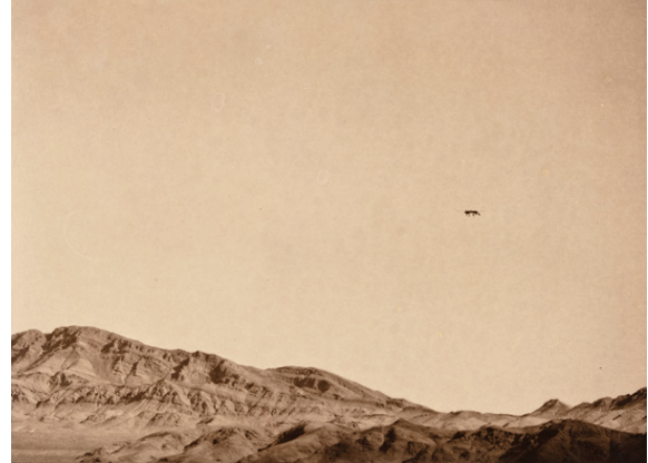
Trevor Paglen Time study (Predator; Indian Springs, NV), 2010 - Detail

TP: I think that there is a little bit of any irony in the act of “watching the people who are watching you” here for sure, and it’s certainly something that I’ve developed into a sub-theme quite explicitly in some works. But overall, I don’t think that particular dynamic is something I’m categorically interested in. That reading seems to emphasize the “surveillance” aspect of the work too much, and I’m actually not particularly interested in surveillance, per se. But it does point towards something that I am interested in, something I call “entangled photography” or “relational photography” – what I mean by this is thinking about photography beyond photographs. What happens if we start thinking about the practice of photography as embodying the critical moment in the work? In other words, what if the “fact” of photographing something is the essential critical point of a work? I started thinking about this a while ago when I was photographing secret military bases and CIA prisons – for me, a crucial part of those projects is not always what the images look like so much as the politics of producing them.