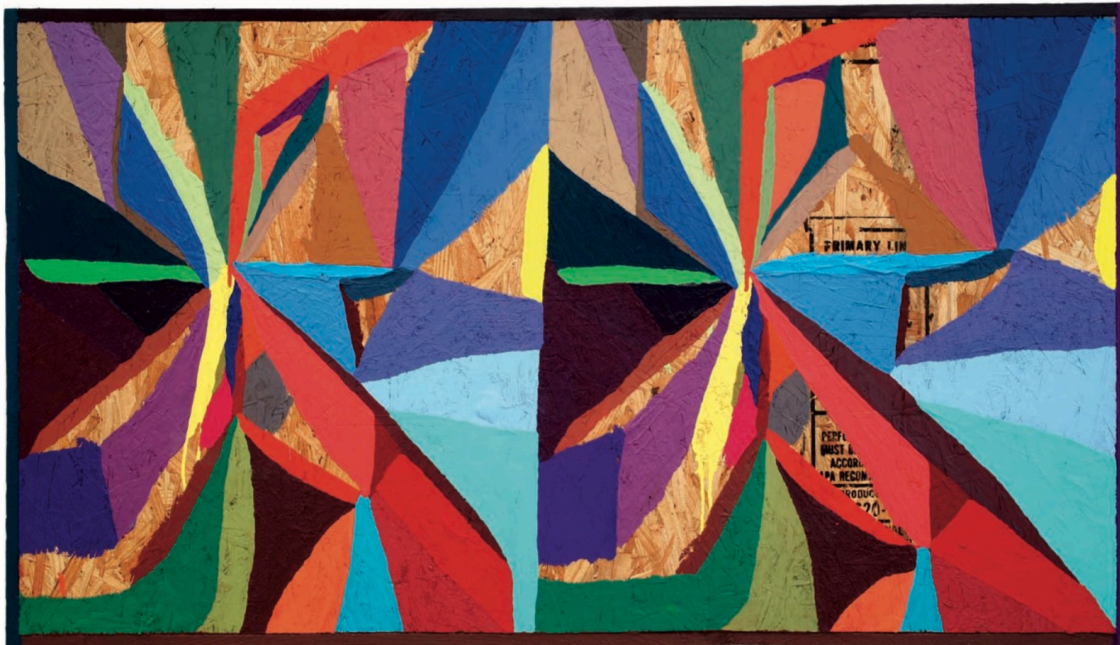
Opposite page: Chris Johanson, Untitled , 1996, acrylic on wood, 60 x 40".